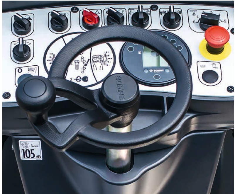
Large switches, a compact steering wheel and clearly arranged controls make it easy for any operator to work with a light BOMAG tandem roller.

Every function is self-explanatory and intuitive to operate after a very short time. As with every BOMAG tandem roller, the main functions can be selected precisely and error-free by the ergonomic control lever.