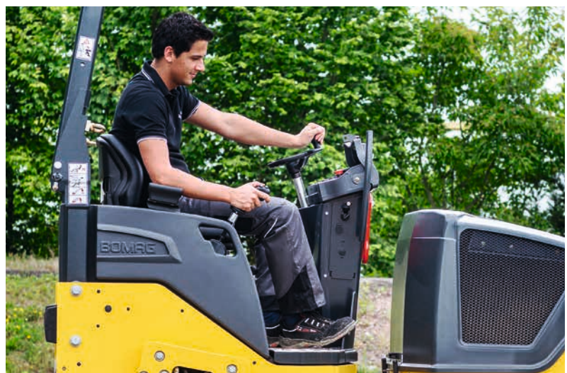
Ample leg room for the operator ensures a comfortable working environment.

The response of the control lever is very pleasant; reversing is modulated and very precise. Drum vibration can be activated selectively for the front or rear only, or for both drums. In tandem with the IVC (Intelligent Vibration Control) system, the exciter system guarantees consistent compaction and reliable operation at all times.