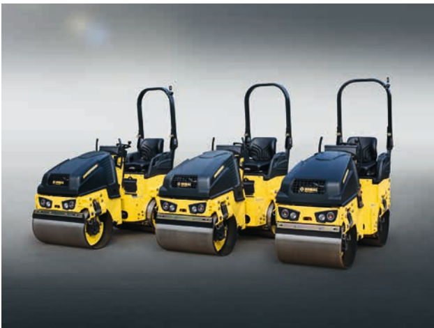
BW 80/90/100: The light line up to 3,968.3 lb.