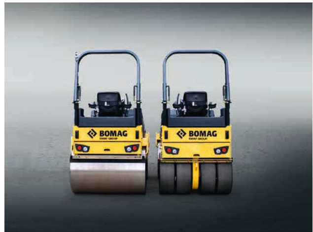
BW 135/138: The heavyweights from 8,598 to 9,479.9 lb.