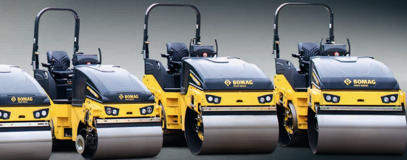
BW 120 AD-5