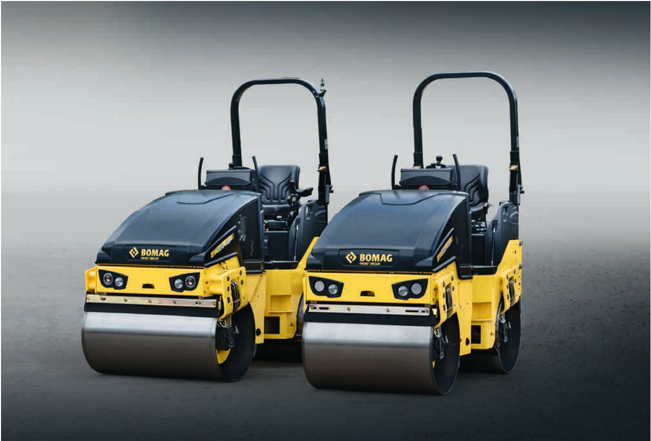
BW 100/120: The multi-talents from 5,070.6 to 8,157.1 lb.

BOMAG offers the right machine for every application. Select the roller and equipment that is perfectly suited to you, your requirements and your company from 14 different models.